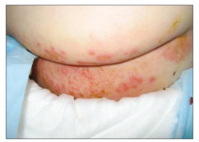
Figure 2. Incontinence-associated dermatitis in a patient with C. difficile.